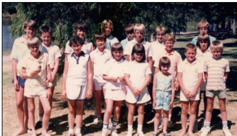
Tatong Junior players 1986 at a tournament at the Benalla Gardens courts.