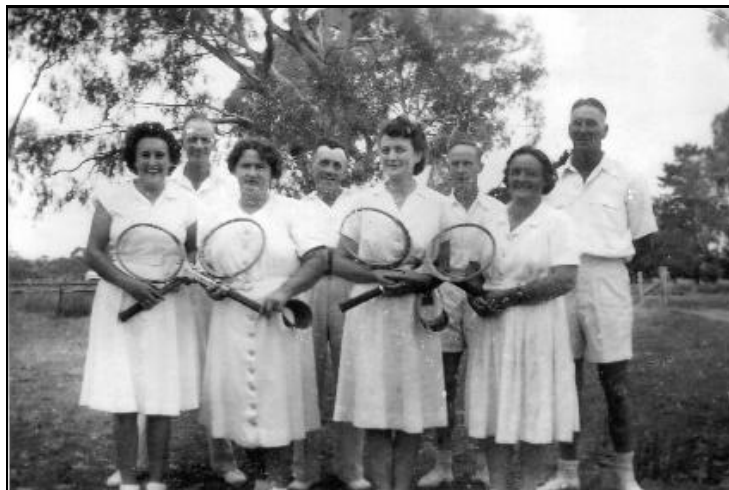
Tatong Tennis team 1940's

The junior tournament was also popular and attracted 26 entries on the Sunday the 13 th March 1988, making a very busy weekend for the Tennis Club before competition finals started the next weekend.