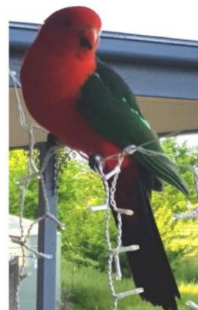
George the Traitor