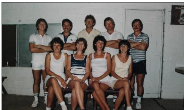
Tatong A Reserve Premiers 1985