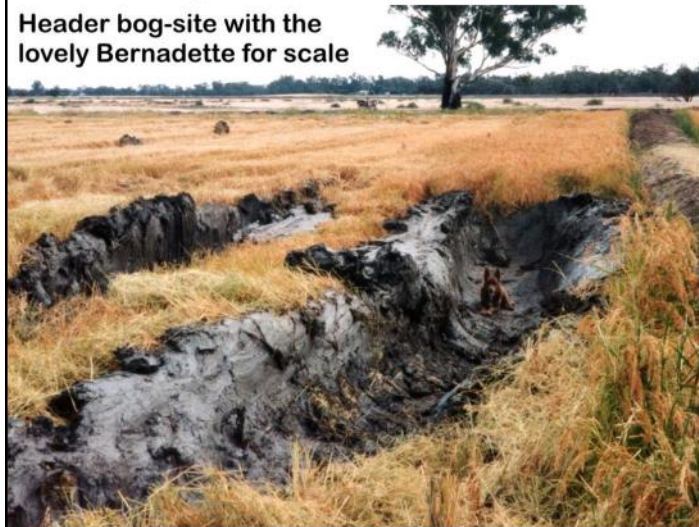
Header bog-site with the lovely Bernadette for scale

Fitting 'tracks' to the header, instead of wheels, made a huge difference. But the tractor pulling the snigging bin was still on wheels, and liable to get into trouble. In theory, summer harvest was safe from bogging. An exception was the year irrigation water escaped into an area beside the barley crop. One moment the header was chuffing along, the next it became stationary and lop-sided. The header driver copped a bit of flak for getting a